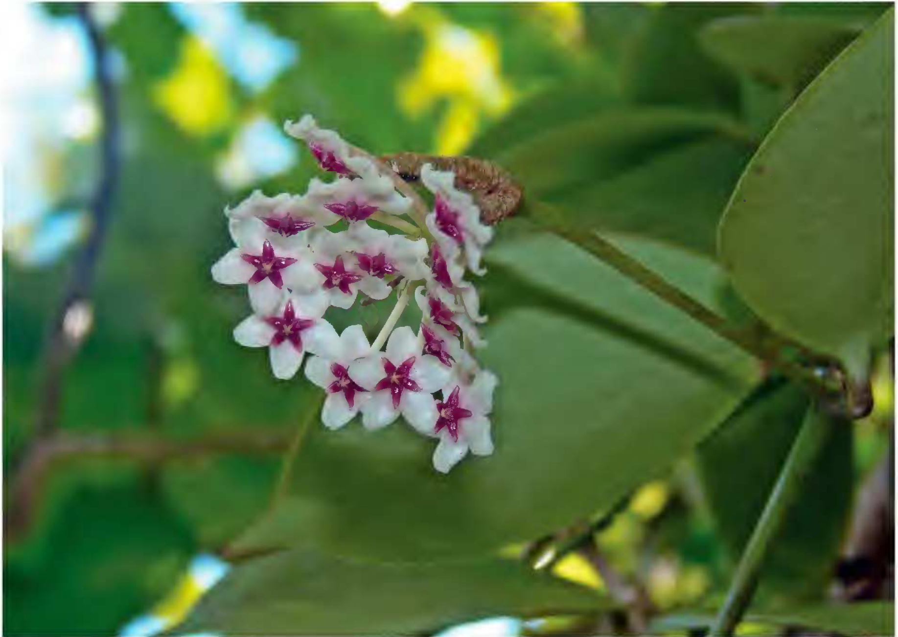
Fig. 1. Inflorescence of Hoya anulata.